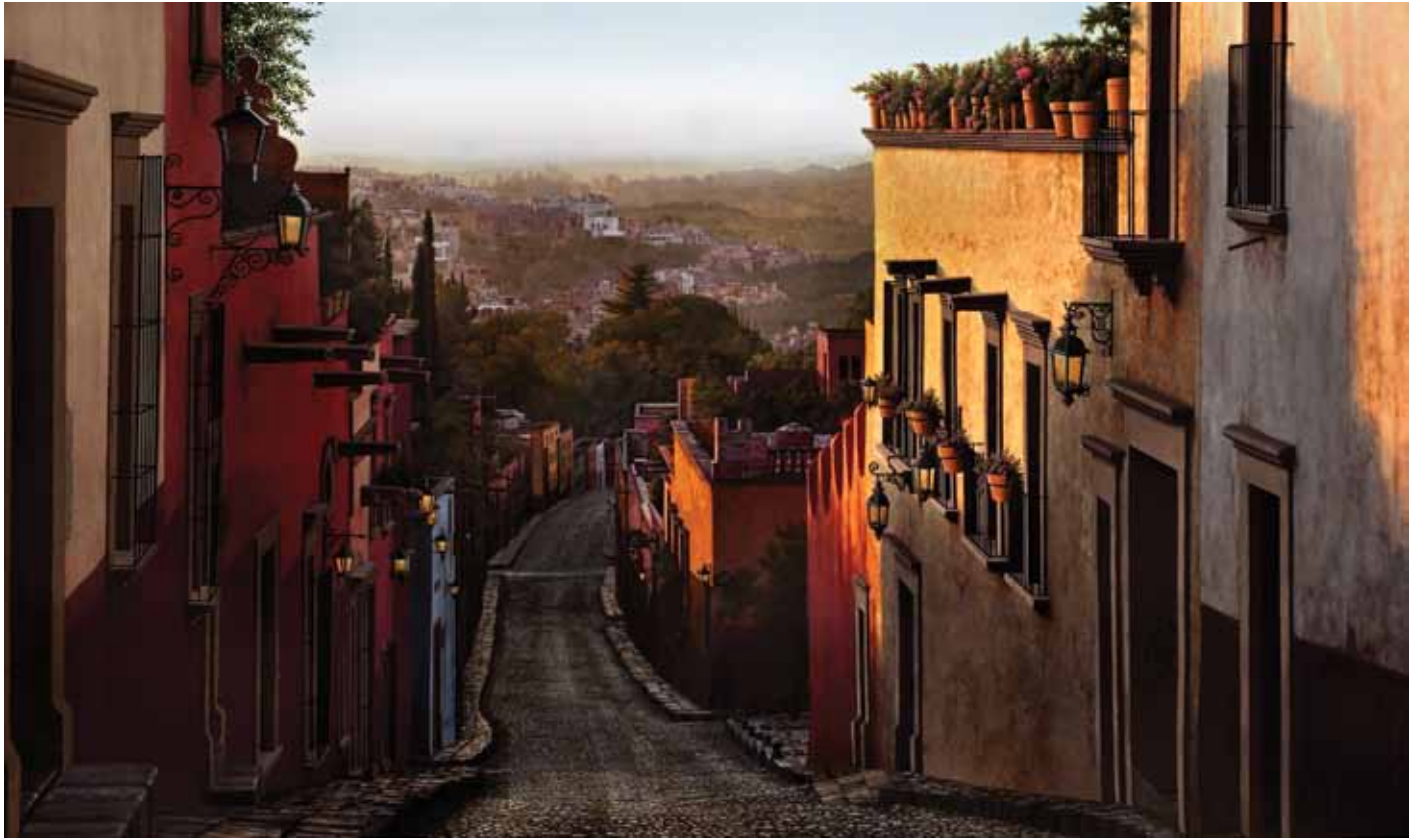
Late Afternoon Memories, 2011