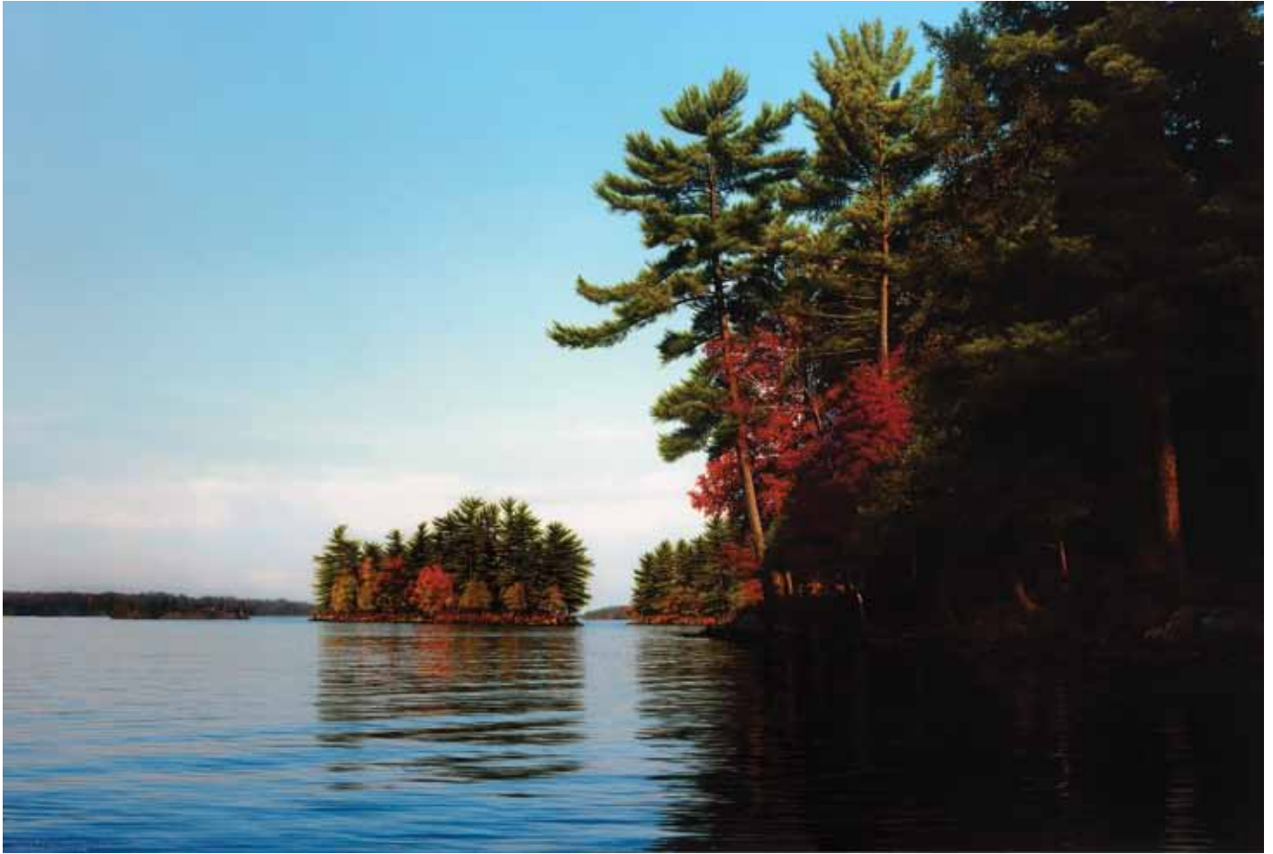
Up Lake Rosseau from Sandy Bay, 2011