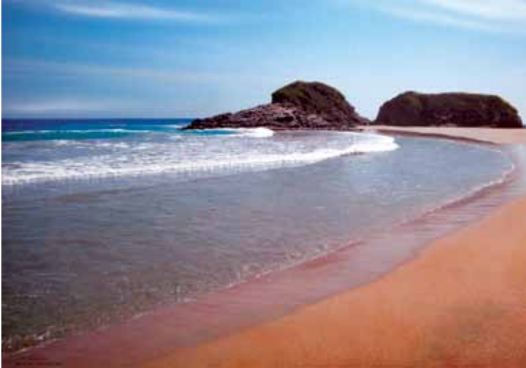
Little Agustinillo, 2010