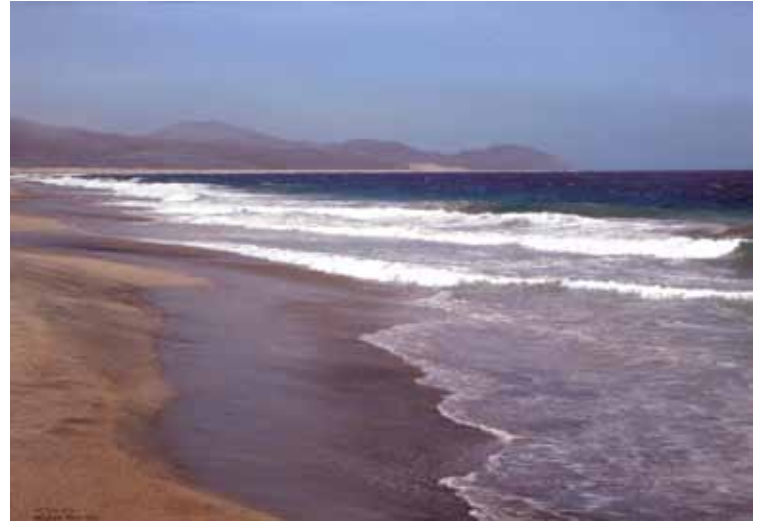
La Colorada, 2010