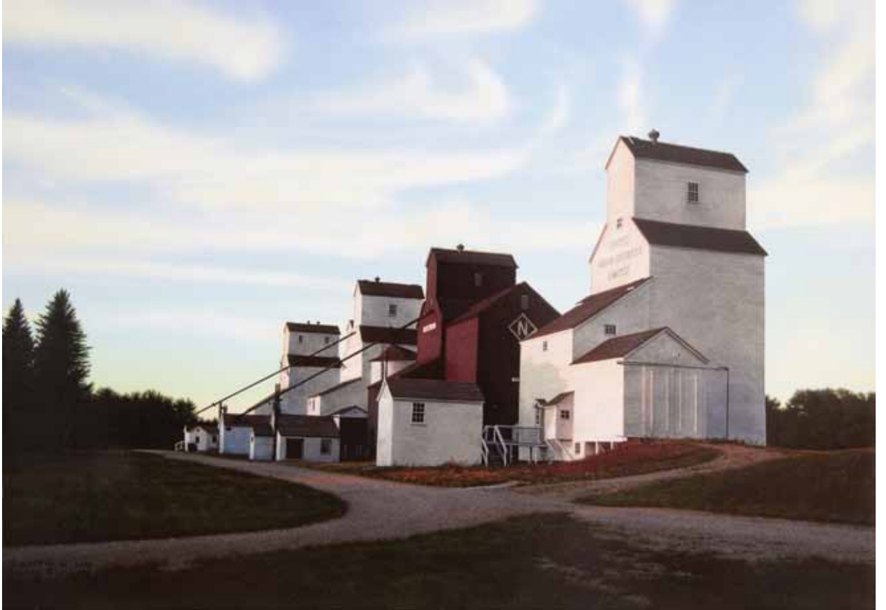
Sun Setting on Icons, 2010