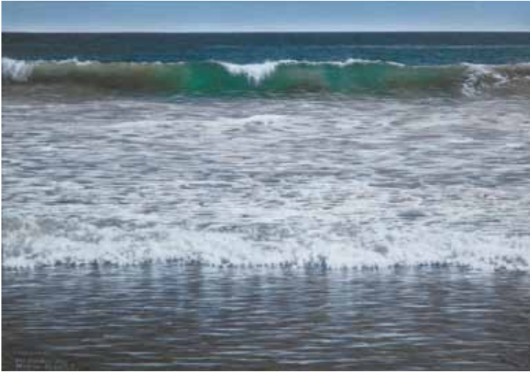
The Blue, Blue Sea, 2010