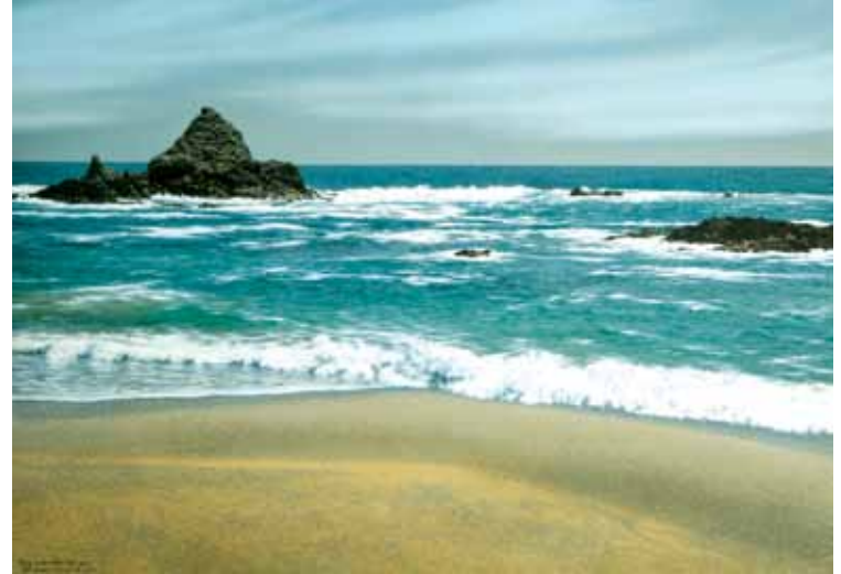
This Rock Within the Sea, 2010