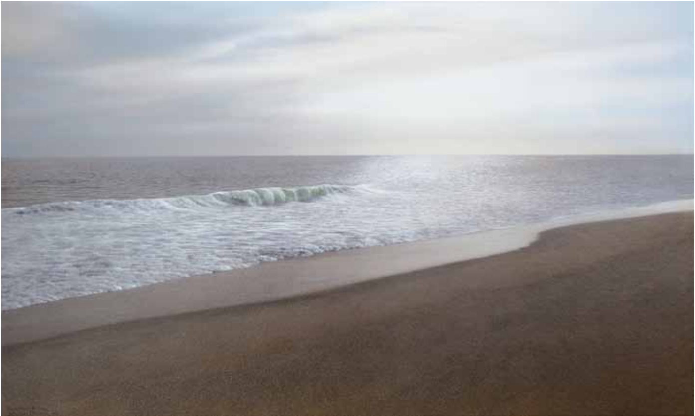
Perpetual Motion, 2011