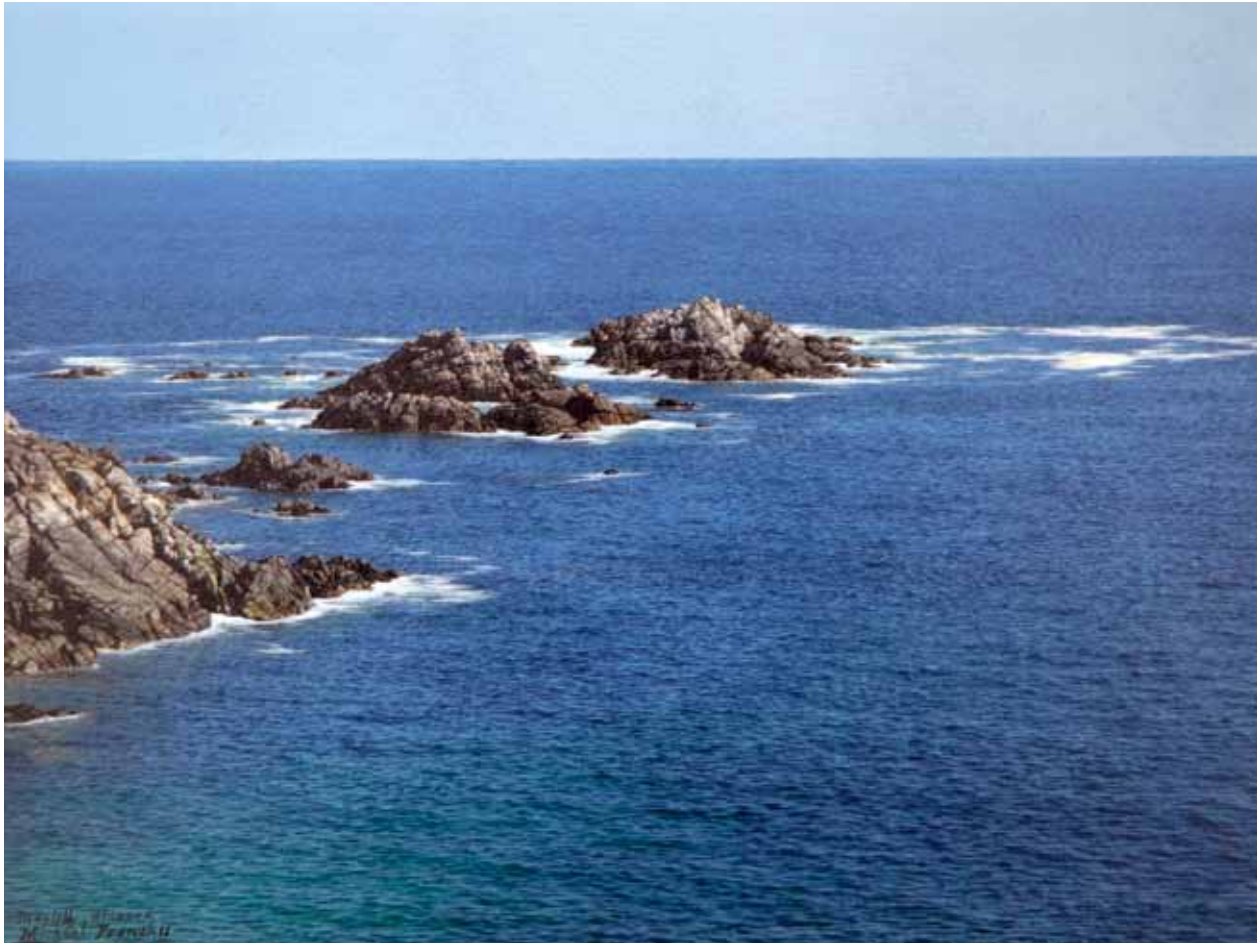
Indelibly Stamped, 2011