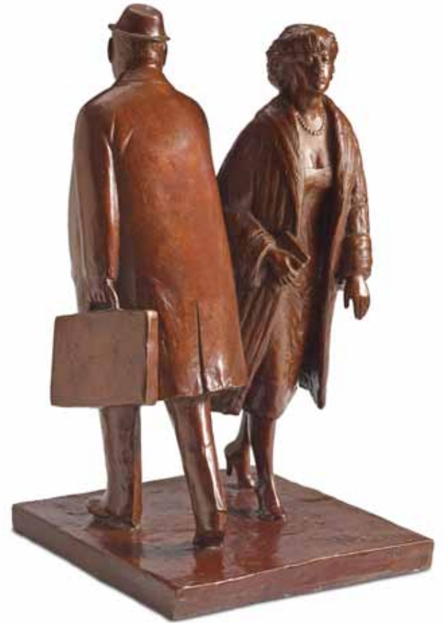
RIGHT: Title , date

Quote Here? Axim comnisquo tendia dollore mporatum ipicipi enihicient, si dolore qui consequatiam ut, volorem nonsenis eatiaec tatquatet quiant, cusciliquaes eius venimusa destores repre cones quam abora.