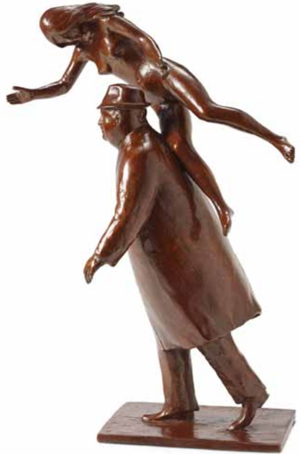
RIGHT: Title, date