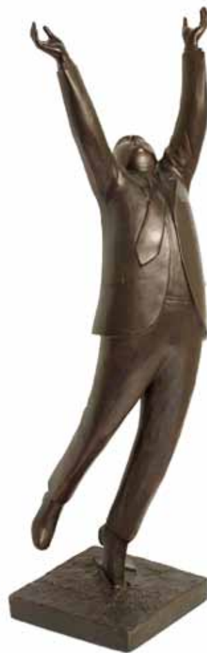
RIGHT: Title, date