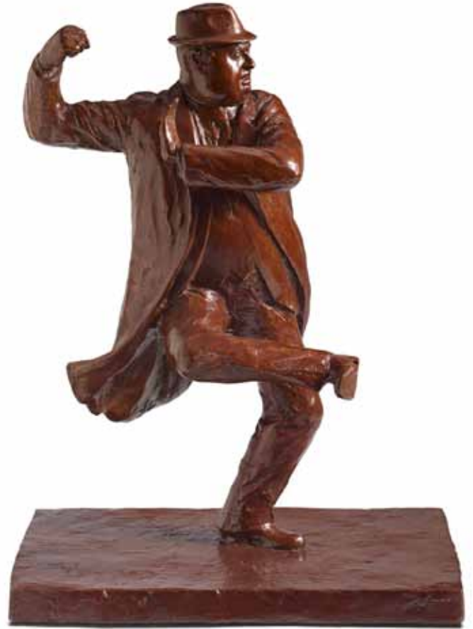
RIGHT: Title , date